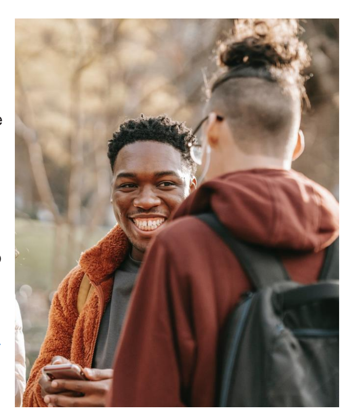
Spotlight on Young Adults' Mental Health

Feedback will be evaluated after the pilot with the aim of finding a long-term delivery plan.